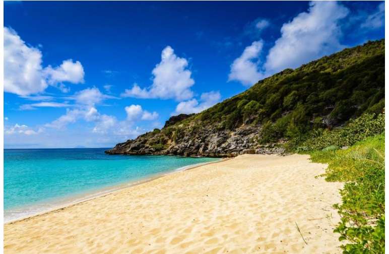
Castelhanos Beach, Ilhabela