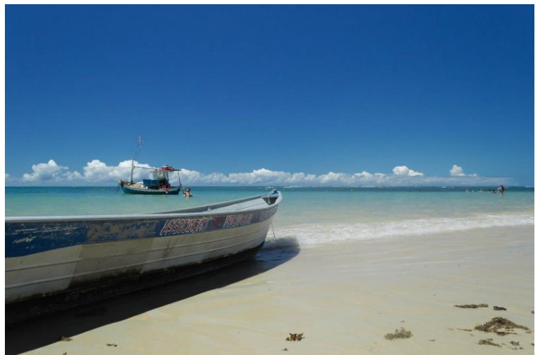
Puruba Beach, Ubatuba